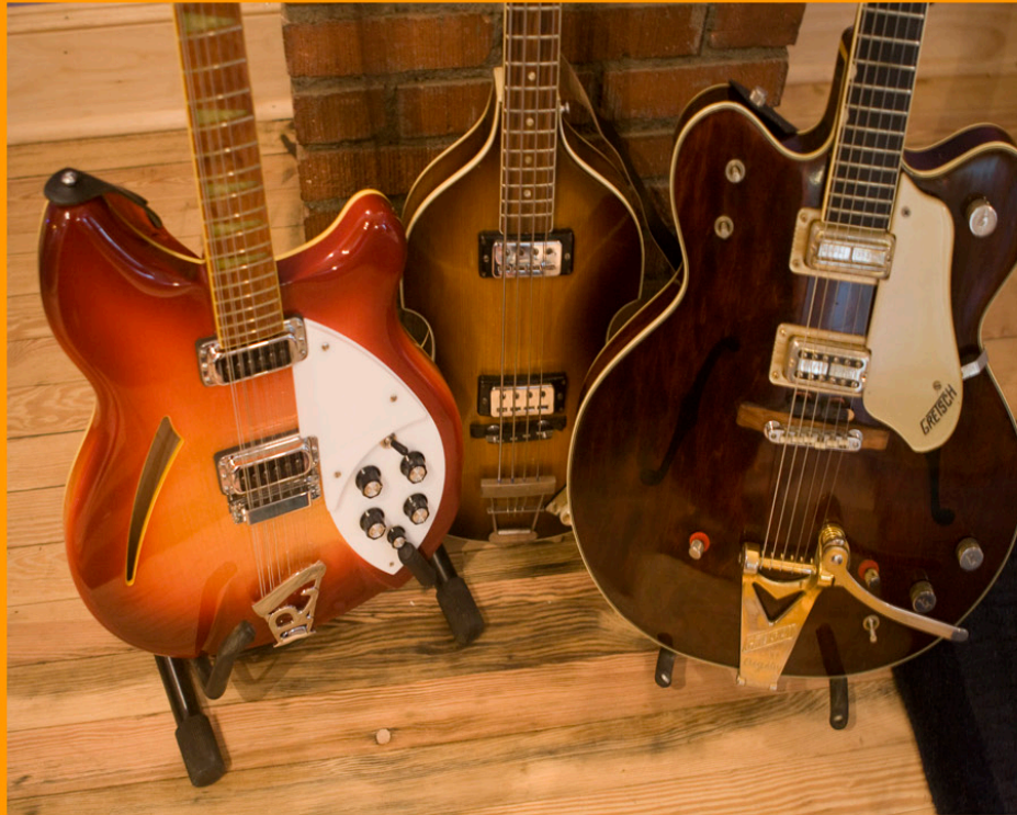
My Rickenbacker 12, '66 Hofner & '65 Gretsch Country Gentleman